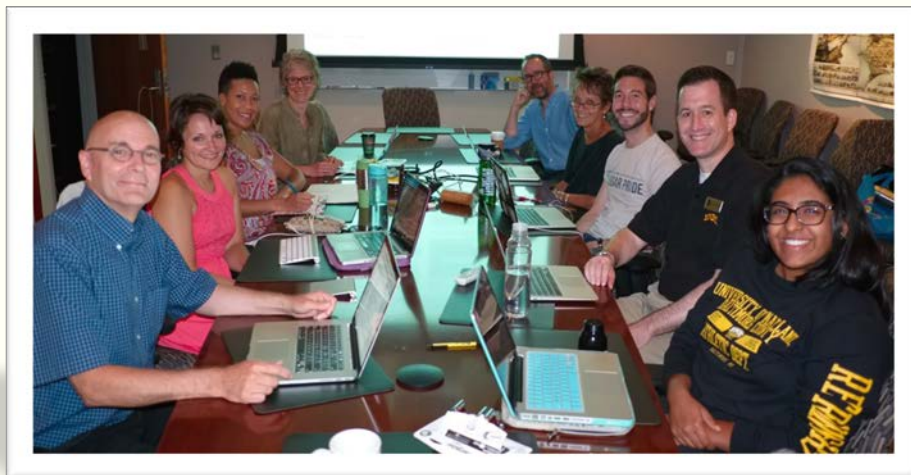
Shot of the IA UMBC planning committee in a working meeting